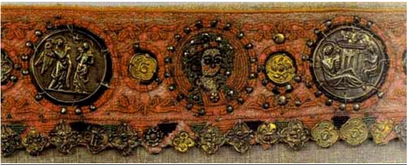
A horizontal border, from Alter Hanging, 1250 - 1300 in coral, gold bezants and glass beads. From Halberstadt Germany

As you can see in the extant examples above, beads & precious gems were used for embellishment throughout the Middle Ages and before. There are just too many paintings to show - with artists depicting the finery of the peoples of the times with wonderful examples of bead work on their clothing. I hope these few examples give inspiration for beadwork today. I believe those of us who enjoy beads no longer have to prove they existed in history.