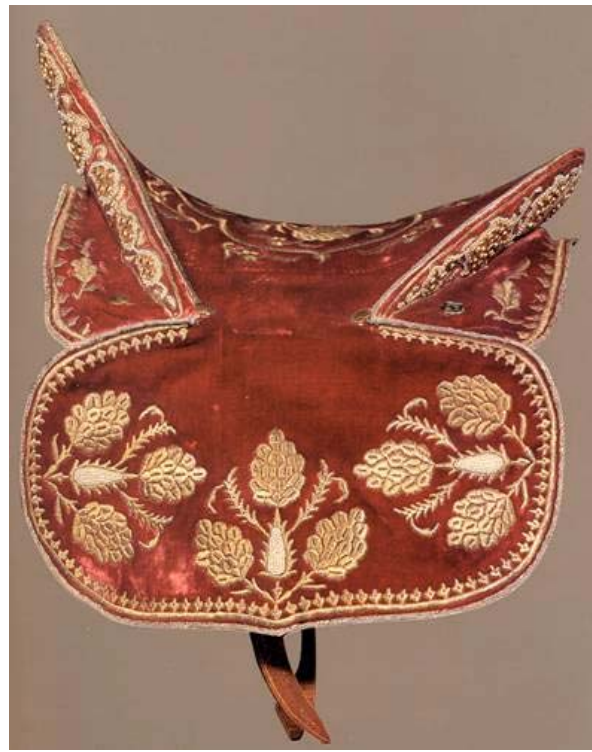
Saddle - Russian Collection Moscow Kremlin Turkey 1550, Wood, velvet, leather, gold, rubies, emeralds, pearls, chasing, weaving, and embroidery.