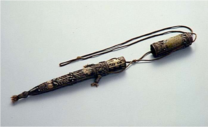
Full Needle Case - the delicacy of the work and embroidery is amazing.