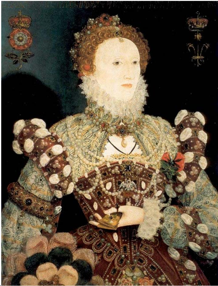
Portrait of Elizabeth I (The Pelican Portrait) Artist: Nicholas Hilliard, circa 1574