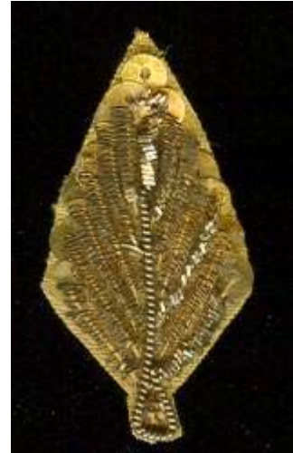
circa 1380, Venetian Gold Leaf with spangles & Frise