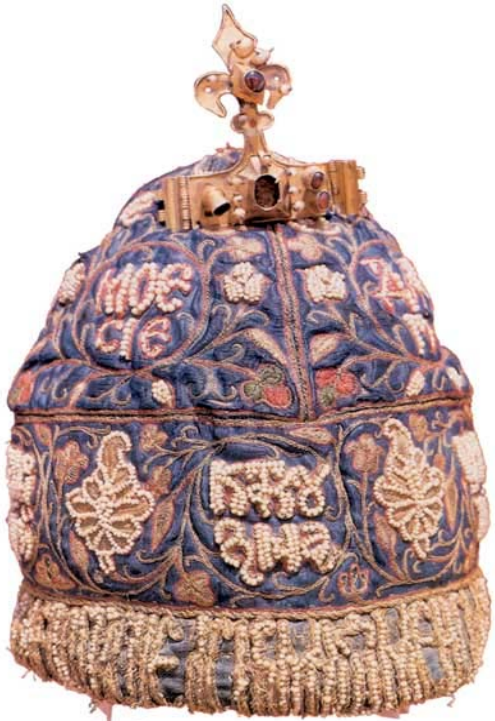
Mitre - Serbian Orthodox Church Silk with embroidery & pearls. 1300