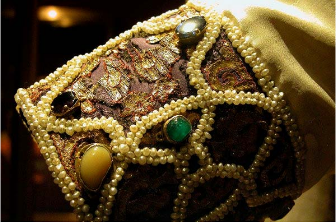
Detail of lower cuff.