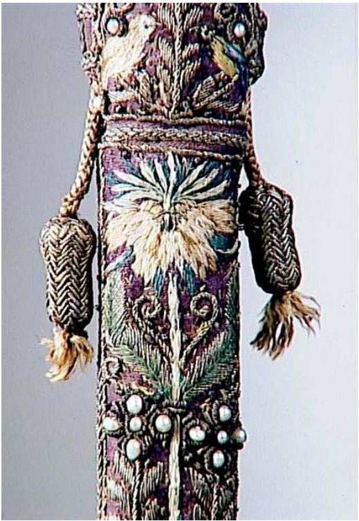
Needle Case (Venice ?) Late 1500 Embroidery over wood with pearls