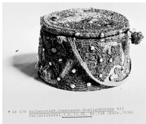
+ 89 679 Halberstadt, Diocesanmuseum, Hostienbüchse mit Perlstickerei, 1.H. 13. Jh. Nr. 148 (Aufn. 1936) 13 th Century Reliquary Box - German - glass seed beads, bezants, Halberstadt, Germany