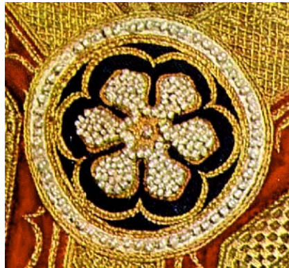
15 th Century Mantle Florette