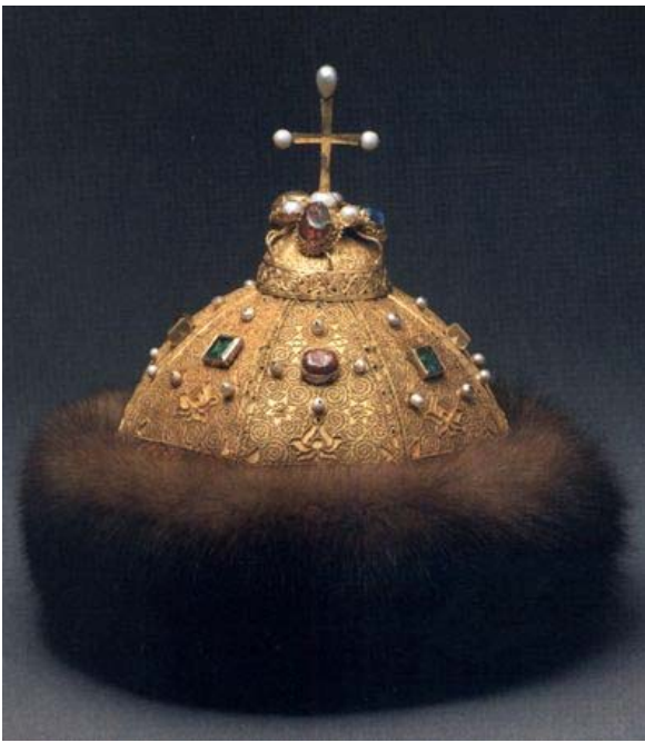
"Cap of Monomakh" - Russia (Original Coronation Crown of Tzars), late 13th-early 14th century. Gold, precious stones, fur, silk; casting, chasing, carving, filigree, seeds of gold. Moscow Kremlin.