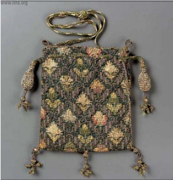
England early 1600, "swete" bag. Linen plain weave embroidered with silk, gold metallic threads, seed pearls, braided silk and metallic cords and tassels.