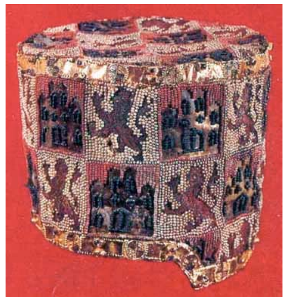
A beaded hat, Fernando de la Cerda 1275. The royal tombs at Burgos, Spain