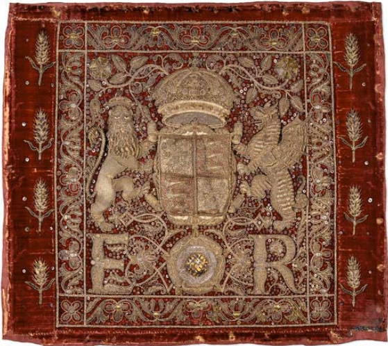
A burse (pouch) for Elizabeth 1 st . Gold padded embroidery on red velvet with pearls and gold discs. 1580-1604