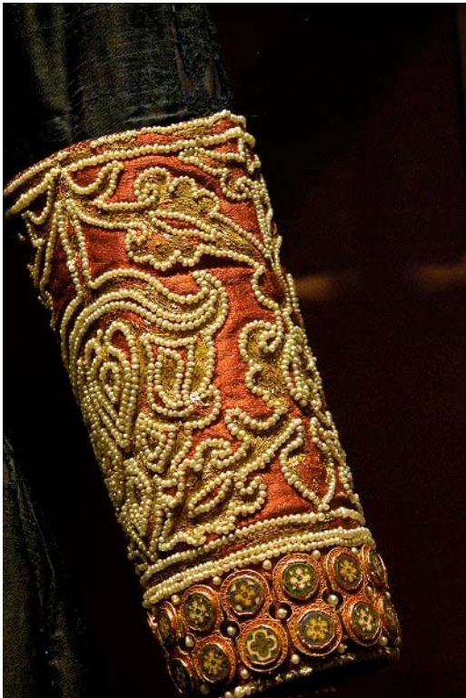
Detail - close-up of cuff