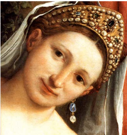
Lorenzo Lotto's - "Venus & Cupid Mid 1520's (Venetian)

The following pages show some of the more famous extant pieces of beadwork embellishment from history, particularly as it applies to our SCA timeframe, (although not in historical order as you view). Also please note that the extant items shown are from all through the European Known World and Middle East in a wide time range, and not "just" church items. Examples are approx. circa 1000 to 1700 CE as time allowed them to survive.