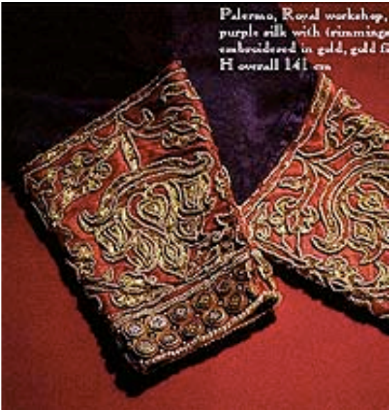
Palermo, Royal workshop, between 1130 and 1154. Purple silk with trimmings in red silk, embroidered in gold, gold filigree, enamel, and pearls; Dalmatic Sleeves.