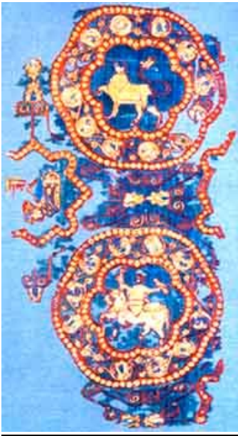
Andalusia (Spain) Silk, embroidery, gold & Pearls. Circa 1147 medallions from a dalmatica.