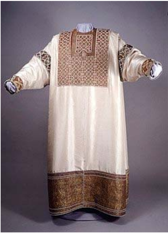
Alb of William II of Sicily - 1181