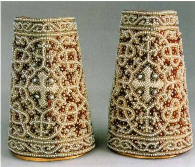
Cuffs, Russia 1550, Velvet, silk, pearls and gold.