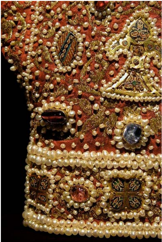
Detail of top side of glove.