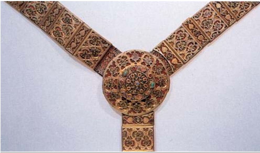
Horse Chest Band - Turkey, 1600. at Moscow Kremlin, Russia Leather, woven tape, silk, silver, rubies, emeralds, turquoise, nephrite; gilding, niello, carving, inlay, smithery, weaving.