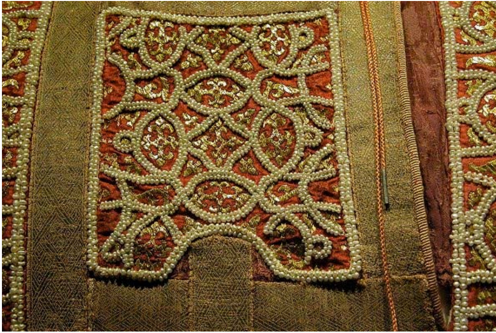
William II Alb - Detail of panel on chest front - note heavy use of pearls on the silk.